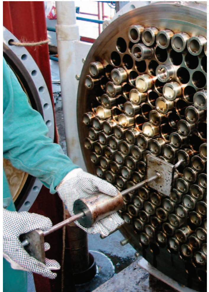
CYCLONIXX® Cyclone Liner Installation into a 36"/ 900 mm Vessel

Normally, system pressure is used to provide the driving pressure, but if too low (<75 psig / 5 Barg), a pump can be used to boost the feed pressure. Typically, single stage centrifugal pumps are used, where pressures are too low.