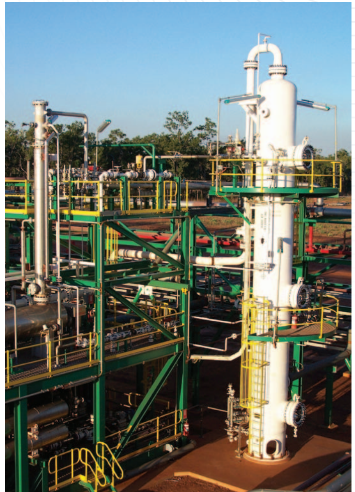
ENI Blacktip Gas Processing facility Location: Northern Territory, Australia

SUEZ's engineers have years of experience in the design and construction of complex plant, which ensures optimal plant design and performance.